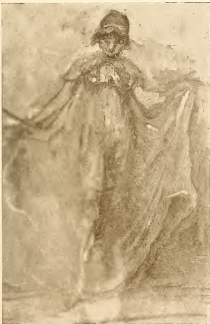
Green and Blue. "THE DANCER." (Water-Colour.)